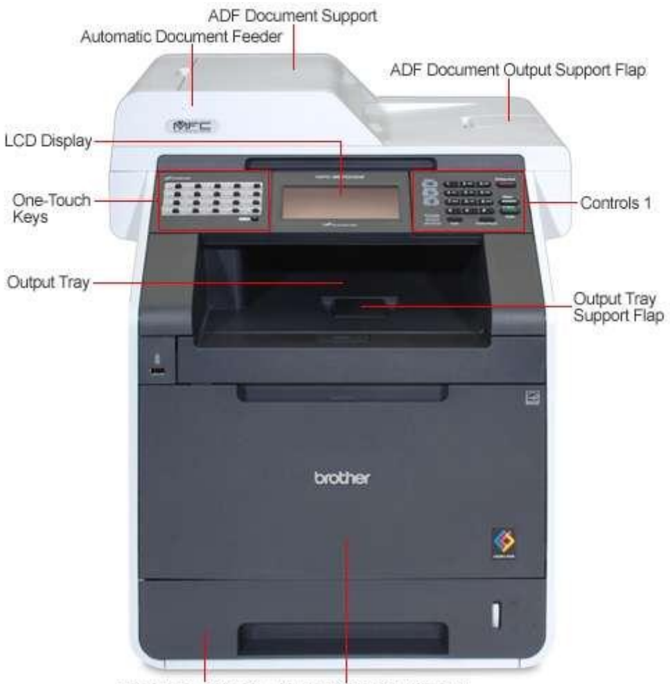
Paper Tray (Closed) Multipurpose Tray (Closed)